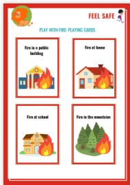
Play with fire - Playing cards