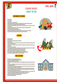
Escape route - What to do