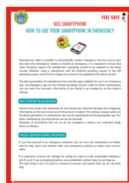
S.O.S Smartphone - Guide on Smartphone use in emergencies